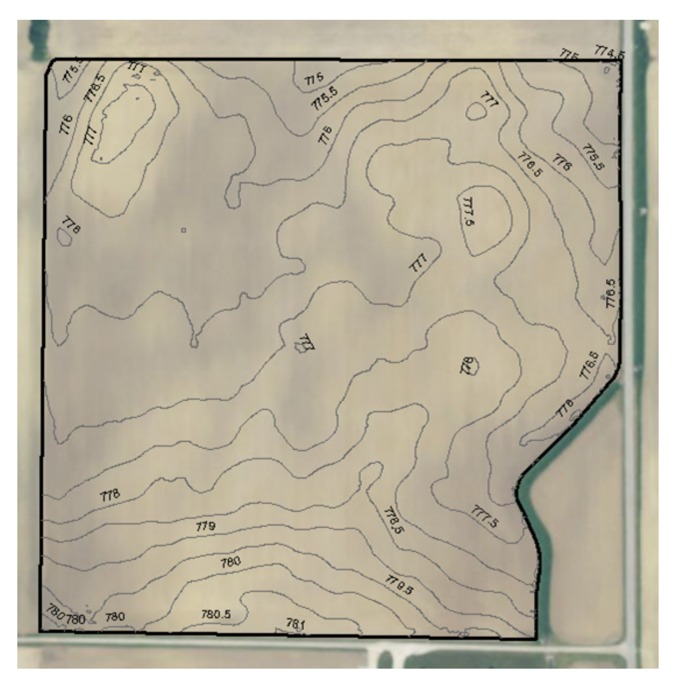
Elevation contour lines (half foot) based on LiDAR